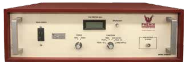
19" Rack Mount Metering Head